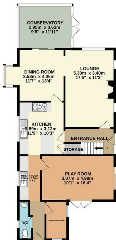
GROUND FLOOR 86.6 sq.m. (932 sq.ft.) approx.